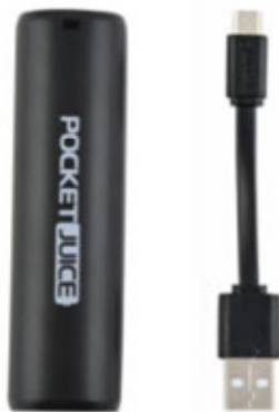
Portable Rechargeable Battery 2000 mHa